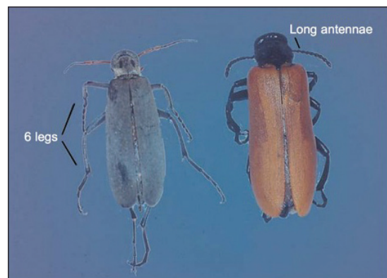
FIGURE 1. Blister beetles.

A third well-known family of blister beetles is the Staphylinidae family. Rove beetles (genus Paederus ) differ from the Meloidae and Oedemeridae families in that they produce the vesicant pederin rather than cantharidin. Pederin causes a more violent eruption called dermatitis linearis, which often is associated with intense urticaria prior to blistering. 1 Rove beetles are found in moist environments and tend to favor tropical and subtropical climates. They may emerge in large numbers after heavy rainfall.